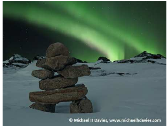
5 Aurora borealis are common in the Arctic tundra at nighttime