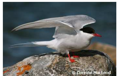
17 Arctic Tern