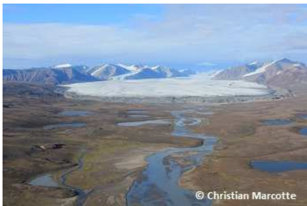
37 Tundra and glacier on Bylot Island, NU

Wildlife Area on Bathurst Island, Nunavut, which is used by Polar Bear and Peary Caribou. Each Migratory Bird Sanctuary holds a significant portion of the Canadian or global population of one or more bird species at some point in the year. For example, the Queen Maud Gulf Migratory Bird Sanctuary alone hosts one million shorebirds and over four million geese each year, and that doesn't even count all the other bird groups like loons, ducks, birds of prey and songbirds. Parks Canada also has a network of protected areas representing environments of Canada's natural heritage. At present, eight national parks can be found within the tundra biome. In the provinces and territories where the tundra lies, areas have also been set aside for conservation