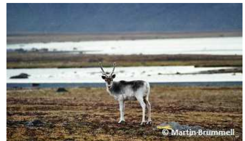
35 Peary Caribou

The tundra as a biome is sensitive to many threats. Climate change is probably the most important element threatening the tundra as a whole, since the landscape in itself, and the species inhabiting it, could change as a result of the melting of the permafrost and permanent ice, the drying of tundra ponds and changes in species' timing of breeding and prey availability. The permafrost is not only melting because of higher temperatures, it is also affected by road and building construction. This melt could, in turn, release tonnes of carbon gases into the atmosphere, since a great quantity of organic matter is stored frozen in the tundra. The decay of this organic mass would increase greenhouse gas emissions, which feeds back into increasing the amount of melt. Because greenhouse cases contribute to ozone depletion, which increases ultraviolet ray intensity, especially at the poles, this would increase the rate of melting ice and speed up climate change.