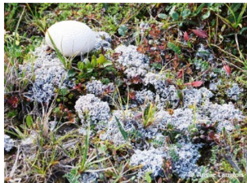
12 Lichens (in gray) on the tundra ground vegetation and fungi