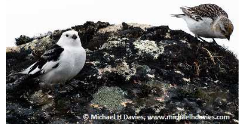
16 Snow Bunting pair