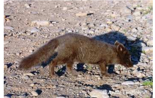
31 Arctic Fox

Arctic Foxes are common in the Arctic tundra, thanks to their adaptations to the cold climate and their varied diet. Their thick furry tail is used not only for balance, but also as a warm cover during the cold months. Just like the Arctic Hare, the Arctic Fox's fur changes colour from summer (brown or grey) to winter (white). The population of Arctic Fox greatly varies due to fluctuations in lemming populations. Arctic Foxes may also eat birds, fish, birds' eggs and even plants. In lean years, this fox will travel great distances to search for food and will feed on carcasses left over from other predators, often following polar bears to scavenge. Other tundra mammals include the ermine, the Wolverine, the Muskrat, the Masked Shrew and the Red Fox.