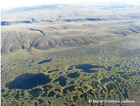
4 Aerial view of the tundra in the summer