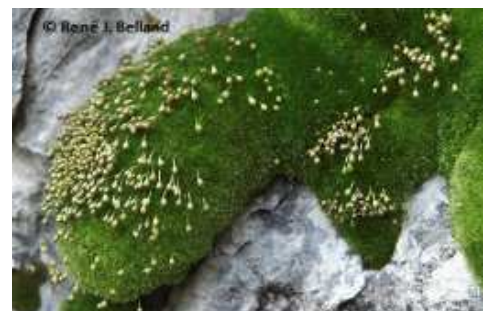
33 Prosild's Bryum

The Canadian tundra is home to species at risk like the Polar Bear, the Dolphin and Union populations of Barren-ground Caribou, the Peary Caribou, the tundrius subspecies of Peregrine Falcon, Eskimo Curlew, Red Knot and Prosild's Bryum. One of the main common threats to