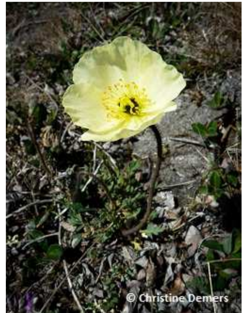
8 Iceland Poppy

Mosses are very common and diverse in the tundra. Some species can grow directly, in the form of a mat, on rocks or soil, being devoid of roots and stems. They play a great role in the tundra, since they actually insulate the permafrost! These primitive plants also do not reproduce by seeds but rather produce spores, which use water and wind as a means of dispersal. Thus, mosses need high moisture to both reproduce and grow (they absorb water directly through their small, delicate leaves), but in the dry Arctic, they survive through droughts by going into dormancy. Peat moss is common throughout the tundra in bogs or other wetlands. Mosses come in a variety of colours, like orange-red moss. One of the tundra's species at risk is Porsild's Bryum, which is a type of moss.