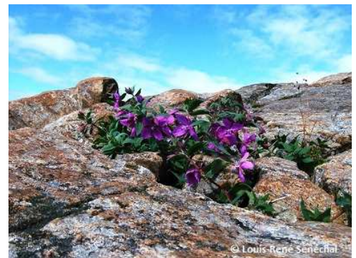
6 Dwarf Fireweed

Plants living on the tundra have adapted to the short growing season, high winds, low temperatures, lack of humidity and low nutrient levels in the thin acidic soil. They have shallow root systems that can only grow in the active layer of soil, or the soil that is not frozen during the summer. Growing close to the ground to take shelter from the strong winds and take advantage of pockets of dark soil and rocks that absorb heat, tundra plants tend to stay short and grow flat on the soil, as is the case for the purple saxifrage, the Net-veined Willow and the other tundra shrubs. Another way for plants to stay warm is for different species to grow huddled together or for one individual species to grow in a specific pattern, such as a rosette or in thick mats, like the Moss Champion and Three Toothed Saxifrage. This traps warmer air between individual plants and helps growth.