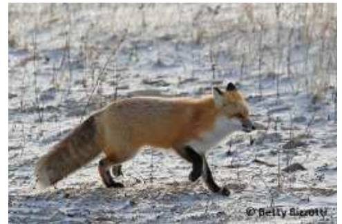
23 Red Fox

The Muskox, a relative of the bison and cow, lives only in the Arctic tundra. This species was a contemporary of the woolly mammoth, which survived to the end of the last ice age. Muskoxen survive the Arctic winters by digging craters with their broad hooves and horns