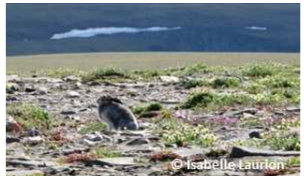
13 Arctic Hare in the summer

The harsh climate and conditions in the tundra biome mean very few species are able to thrive there. Even so, several animals call the tundra home throughout the year, or for at least a few months of the year. Many wildlife species' populations fluctuate up and down in cycles, as is the case for the lemming. While the reasons for these cycles are currently unknown, the cycles do help regulate the populations of predator species that depend on lemmings for food.