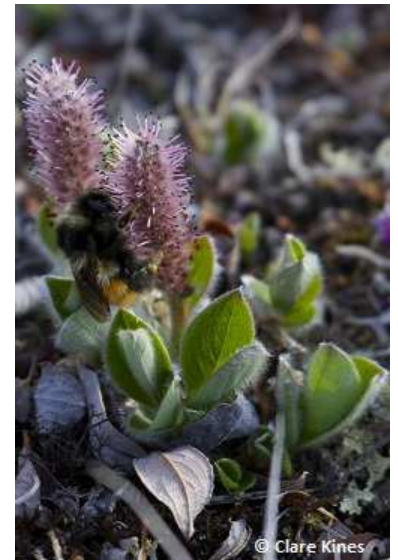
32 Arctic Bumblebee

Many insects and other arthropods can be found in the tundra, such as the Arctic Bumblebee, the common fly, the black fly, the mosquito, moths, butterflies, beetles and spiders. Their life cycles differ, in terms of timing, from those of their southern counterparts, since these species deal with very short summers. Their larval stage tends to be much longer (as long as 7 years, for the Arctic Woolly Bear Moth), and their adulthood tends to be shorter. The larvae of tundra insects must be able to survive freezing in very low temperatures for prolonged periods of time. Bacteria, protists (a group of single-cell organisms, like bacteria, but that are more complex), worms and mites are also found in the Arctic tundra. These small animals are very important for the tundra.