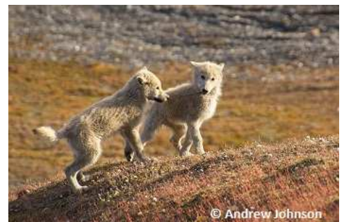
26 Arctic Wolf Pups