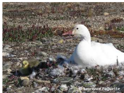
21 Snow Goose with gosling