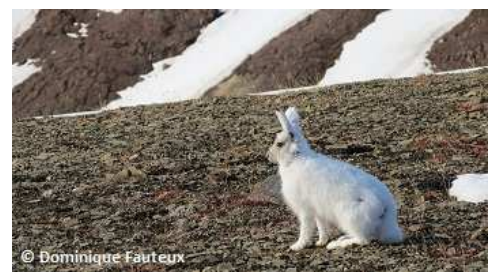
30 Arctic Hare