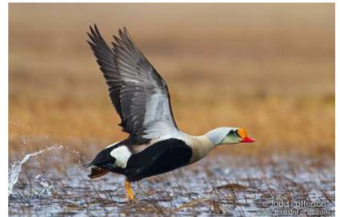
15 King Eider, a waterfowl species found in the tundra wetlands

The Rock Ptarmigan, a grouse species, remains in the tundra throughout the year; its feathered feet keep it warm and help it walk over the snow. Like other ptarmigans, it has three seasonal plumages, including a white colouring in the winter to help it blend in with the snow and camouflage against predators. During the cold months it forages for vegetation by day, eating old berries and dried plant buds and dwarf birch under the snow, and roosts in snowbanks by night or during storms. Some Rock Ptarmigans move closer to the tree line in the winter and instead roost in shrubs. In the summer, they feed on a variety of tundra plants, especially the many species of willow, saxifrage and heather. The Common Raven is found almost everywhere in Canada, including the tundra. Being an omnivore, it eats a wide variety of foods, which it also hides in caches for the winter. This species is a scavenger—it is able to survive in the cold Arctic climate by feeding from carcasses left over by predators like the polar bear or Arctic Wolf, by raiding the winter caches of other animals like the Arctic