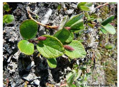
7 The Net-veined Willow, a dwarf Arctic willow