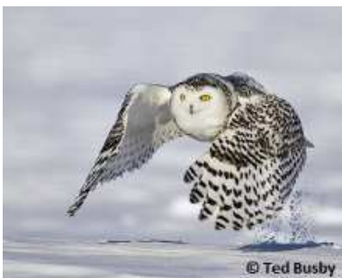
20 Snowy Owl