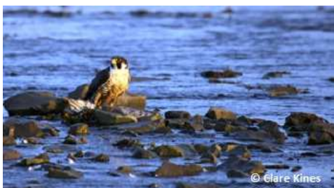
22 Peregrine Falcon of the tundrius subspecies