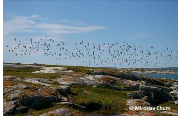
36 Geese migrating in the tundra

To help protect both species and their habitat, Environment Canada has developed a network of protected areas like National Wildlife Areas and Migratory Bird Sanctuaries. There are five National Wildlife Areas and 14 Migratory Bird Sanctuaries in the tundra biome. Several of these protect the habitat of species at risk, such as Polar Bear Pass National