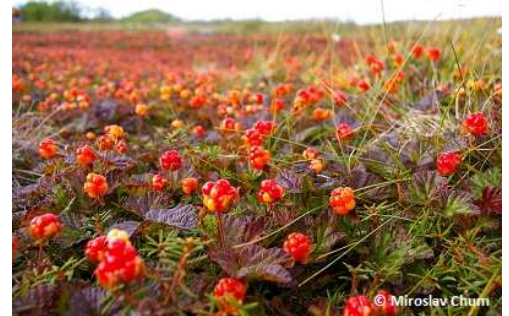
9 The Cloudberry is one of the berry plants which grows in the tundra