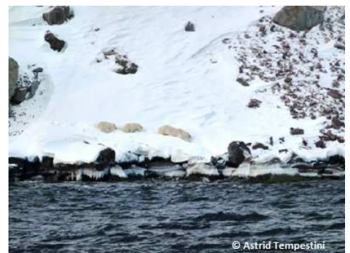
29 Mother Polar Bear and cubs