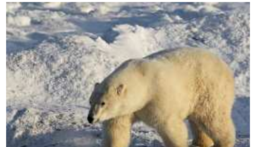
34 Polar Bear

many of these species is climate change. Change in sea ice patterns could prove detrimental to some tundra inhabitants like the caribou, Polar Bear and Ivory Gull, since they rely on ice for migration and foraging. Many tundra species dig through the snow to get to food during the winter, and a possible increase in snow or ice thickness on land could bring famine to caribou populations. By contrast, thinner snow covers could be detrimental to other tundra species, since they rely on snow for protection during the winter. Increasing industrial operations, like mining and oil drilling, and other associated activities, like marine shipping, off-road vehicle use, road construction and blasting, may bring increased traffic, both on land and sea. For species at risk, these threats could include disturbances, loss and fragmentation of habitat, pollution and the introduction of species alien to the tundra.