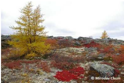
11 Mosses and lichens alongside short tamaracks in the southern tundra

Hardy lichens play an important role as a food source for a variety of species, including barren-ground caribou, which eats mostly reindeer lichen, a group of lichen species, in the winter. Lichens are the result of a symbiotic relationship, similar to the one that forms corals. Fungi provide a structure and the absorption of minerals from the environment (the rock, soil or plant it grows on), while algae or bacteria can produce energy from light via photosynthesis to feed themselves and the fungi. The alga or bacterium lives embedded within the fungus, and this association of different species makes for a great variety of lichens of different colours and shapes. Lichens, like mosses, need moisture to grow and can go into dormancy if conditions are too dry. Their growth is very slow, but they can live for extended periods of time (as much as 4,000 to 5,000 years!) if left undisturbed. Lichens are very sensitive to air pollution, and scientists use them as a bioindicator of air quality.