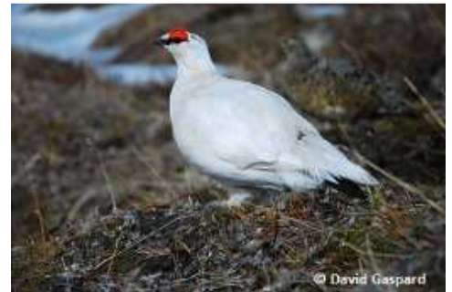
18 Rock Ptarmigan in winter plumage

The Snowy Owl is one of the tundra's most recognizable birds. This large owl is mainly a tundra breeder, migrating to southern Canada and the northern United States for the winter, but some individuals also overwinter in the southernmost areas of tundra as well. It is well adapted to the cold, with dense layers of down and feathers that extend onto the bill, toes and claws to provide insulation. Since lemmings are one of this bird's main prey species, the snowy owl's population fluctuates with lemming populations. When lemming populations are low, the Snowy Owl will feed on Arctic Hare and birds ranging from small songbirds to ptarmigans to medium-sized geese.