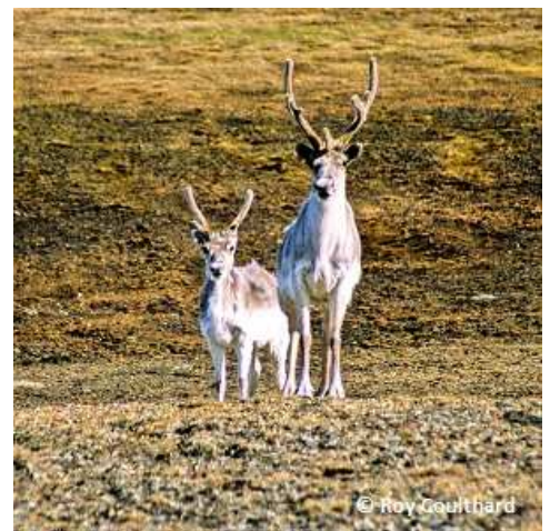
25 Peary Caribou