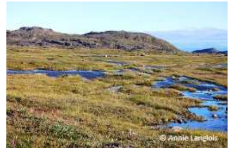
1 Tundra, Baffin Island, in Nunavut