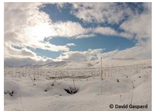
38 The tundra under the snow

To ensure conservation of the tundra and its species', research is underway to find out more about the biome. Environment Canada employs several of Canada's top Arctic research scientists and supports millions of dollars a year in Arctic monitoring programs. In addition, the Centre for Northern Studies at Université Laval in Québec City, the Churchill Northern Studies Centre in Churchill, Manitoba, the Aurora Research Institute in Inuvik, Northwest Territories, and the Nunavut Research Institute in Iqaluit, Nunavut, have many fascinating projects on tundra ecosystems and species. The Canadian Wildlife Federation also supports several research projects with its Species at Risk Fund, including projects on the Polar Bear, the Ivory Gull and the Red Knot. The projects aim to find out more about these species, their ecology and improvements in their conservation.