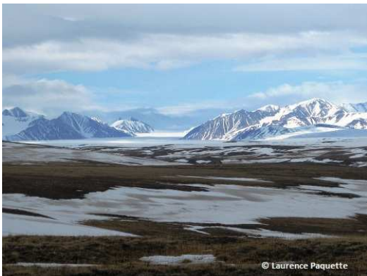
2 Tundra on Bylot Island, Nunavut

The Arctic tundra is the biome that lies between the edge of the taiga (or boreal forest), or tree line, and the permanent ice caps closer to the North Pole or the Arctic Ocean. It is composed of a variety of landscapes, from sweeping lowlands to towering mountains. Often thought of as a barren and somewhat rocky biome, the tundra surrounds the pole and is the dominant biome in the Arctic and Subarctic regions.